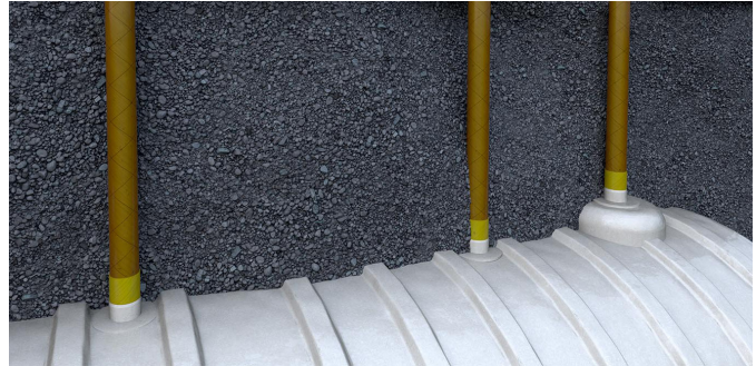
Red Thread IIA Riser Pipe Assembly

Once tapered you can dry fit the tapered pipe into the adapter and check insertion to verify that the taper has been made properly. See Average Taper Dry-Insertion Length table for more information,